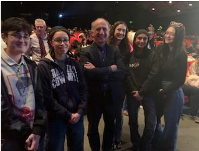
Pictured above Armando Iannucci 'in the thick of it' with SHSG students.