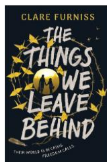
The Things We Leave Behind Clare Furniss Simon & Schuster